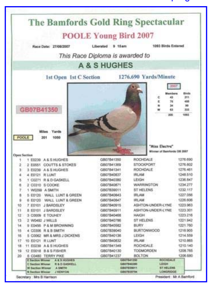
Race Certificate direct from the "Toolkit" program